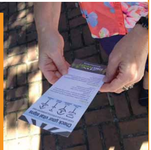
KMM jumpstarts its Walk Safe Campaign at Kilmer Square Park.